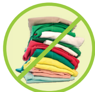
NO Clothing, Shoes, or Textiles