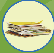
Dry Paper, Newspaper, and Junk Mail