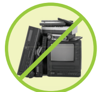
NO Electronics (recycle at a Community Collection Center)