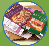
Dry Paperboard Boxes