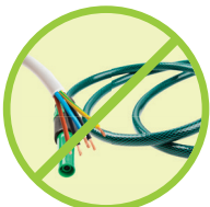
NO Garden Hoses, Cords, Ropes, or Wires