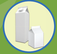
Clean Milk and Juice Cartons