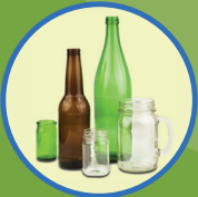
Clean Glass Bottles and Jars