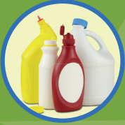
Clean Plastic Bottles and Containers (caps on)