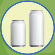
Clean Aluminum Cans