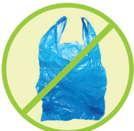
NO Plastic Bags or Film