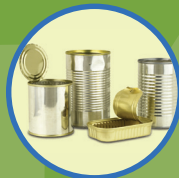
Clean Steel and Tin Metal Containers