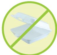
NO Polystyrene Foam or Styrofoam™